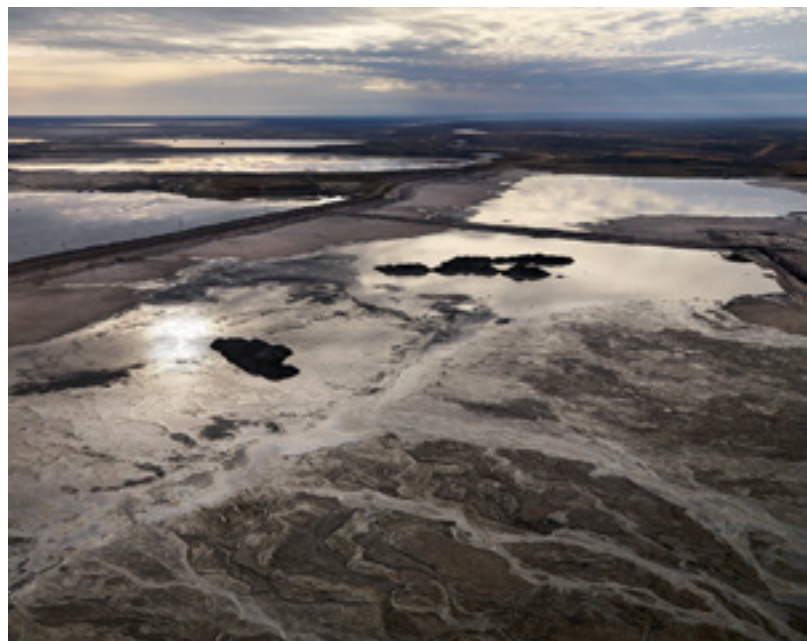
Fig. 4 Edward Burtynsky, Alberta Oil Sands #10 , Fort McMurray, Alberta, Canada, 2007.

Burtynsky's painterly preoccupation with composition and light in his Oil Sands images resonates with the aesthetic registers of the picturesque and the sublime. In landscape painting, the sublime has traditionally been defined as the awe or anxiety felt in the face of nature's power over humankind (Haworth-Booth). Inversely, Burtynsky seeks to provoke the awe felt when witnessing the grandeur and horror of human-altered landscapes by capturing their scale (Burtynsky, Manufactured Landscapes ). His method of using large-format cameras and reproducing the images as large-format (up to 100cm x 150cm) pictures is an intentional strategy to evoke the Kantian mathematical sublime where sheer scale produces awe. However, Burtynsky's strategy of capturing the toxic landscapes of the Tar