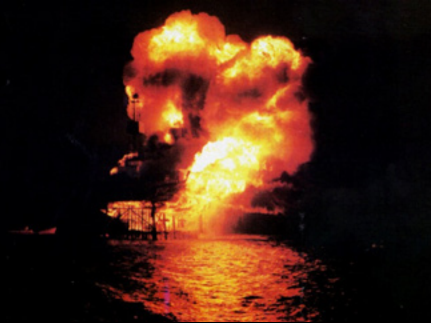
Fig. 1 “Mayday Mayday... we’re abandoning the radio room; we’re abandoning the radio room. We can’t talk any more, we’re on fire.”—Mayday Message from the Radio Room before it was engulfed by the fire