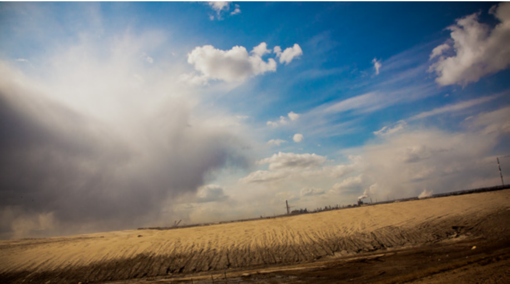
Fig. 8 Andriko Lozowy, Image 19

that a photograph should be read counter-intuitively, “not as an arrest of movement or a freezing of time, but as a collection of signs that is always potentially mobile”. This relates to Gilles Deleuze’s notion of the movement-image, where the movement-image reflects a commitment “to show or create the kind of space of movement that is prior to the representation of static objects” (Thrift and Dewsbury 417).