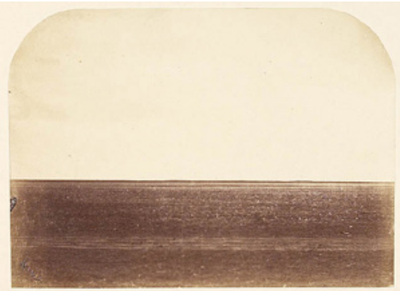
Fig. 7 Humphrey Lloyd Hime, The Prairie, Looking South .

landscapes that were ever-present, yet eluded us in our youth. Our intention was to document what we could of the private spheres of Oil Sands production from the roadside—Lozowy with his camera, and me with my sound recorder. 5 With Lozowy driving, I was free to take in the sights. Yet from the car window, with boreal forest cleared and land flattened, the view is not unlike that of the Prairies: a featureless and flat topography dominated by sky.