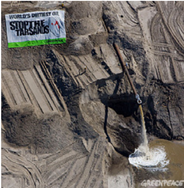
Fig. 3 Greenpeace activists enter Syncrude's Aurora North oil sands operation and suspend a banner that reads "World's Dirtiest Oil: Stop the Tar Sands."

kilometers. Their contents are highly toxic to all forms of life. This was brought to international attention in April 2008 when some 500 migrating ducks mistook one of these ponds for a hospitable stopover, and, on landing on its oily surface, died. When Greenpeace broke into a Syncrude processing facility and suspended a banner that read "World's Dirtiest Oil: Stop the Tar Sands" over the pipe discharging tailings, overnight they changed Canada's historically "green" image to one of "corrupt petro-state" (Monbiot).