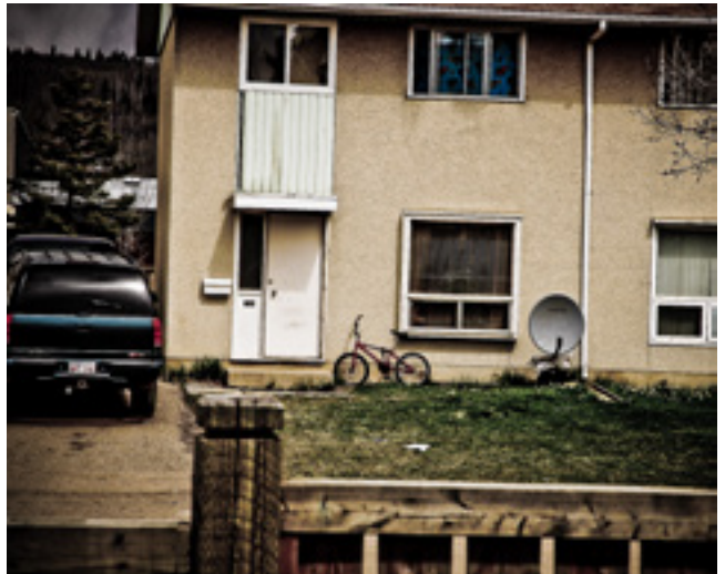
Fig. 5 Six images from the series Where is Fort McMurray? .