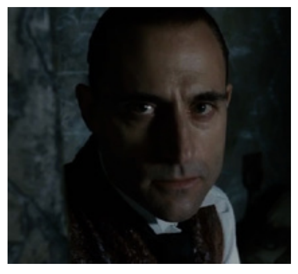
Fig. 2 Lord Blackwell