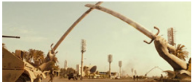
FIG. 6: MANIPULATED INTO THE IRAQ WAR—GREEN ZONE (2010)