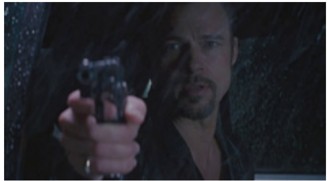
FIG. 3: A THOUGHTFUL HITMAN—BRAD PITT IN KILLING THEM SOFTLY (2012)