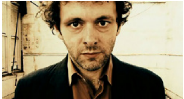
FIG. 5: WESTERN JIHADIST—MICHAEL SHEEN IN UNTHINKABLE (2010)

In productions like these, counterterrorism came across increasingly as an amoral struggle in the shadows—an obvious reaction to the Abu Ghraib scandal and revelations about suspects disappearing in a secret CIA prison network. In Body of Lies (2008), agent Roger Ferris (Leonardo DiCaprio) is such a shadow warrior, who sets up a fictitious terror group, equips it with fake bank accounts, and plants messages in fundamentalist chat rooms – in order to flush out an Al Qaeda mastermind