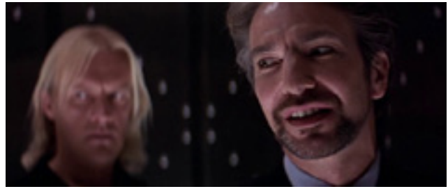
FIG. 1: CRIMINALS POSING AS TERRORISTS DIE HARD (1988)

To start with the origins of the cinematic depiction of terrorism, its modern understanding—as a form of politically motivated violence aiming to achieve mass coverage—was first adapted in the 1970s. Back then terrorism had not yet struck the US directly, the entertainment industry looked abroad for inspiration. Major events like the Munich hostage massacre or the Entebbe rescue mission were re-enacted ( 21 Hours at Munich , 1975, Victory at Entebbe , 1976). John Frankenheimer's Black Sunday (1977) was exceptional, because it featured Palestinian terrorists targeting the Super Bowl finale (Prince 22–28).