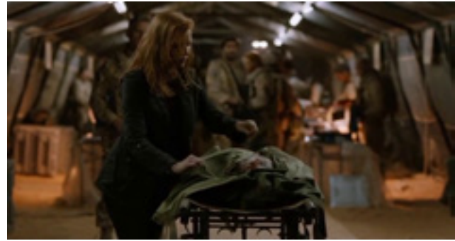
FIG. 8: JUSTIFIED REVENGE FOR 9/11—IDENTIFYING OSAMA BIN LADEN (ZERO DARK THIRTY, 2012)

In comparison, the Vietnam movies of the 1970s and 1980s had the benefit of hindsight and offered an opportunity to reflect from