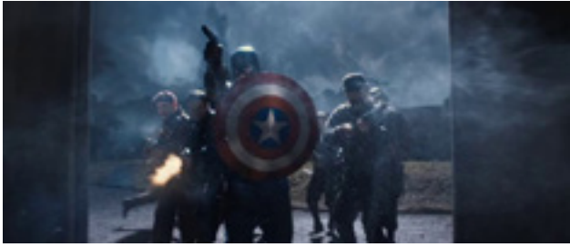
FIG. 2: RECALLED TO DUTY – CAPTAIN AMERICA. THE FIRST AVENGER (2011)

portray a menace to deflect attention from an out-of-control scientific programme. This sort of plotline exemplifies the contradictory nature of the studios approach to 9/11: “They want to tap into the powerful reactions those events induced, while dodging the complex issues and especially the political arguments that might turn off ticket buyers” (Dragis “Bang Boom”).