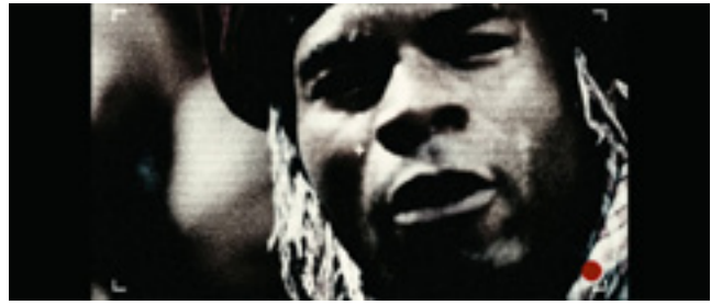
FIG. 9: THE FACE OF THE ENEMY "OTHER"—THE EXPENDABLES (2010)

(3.) It is perhaps ironic that despite its preoccupation with terrorism, Hollywood in fact takes little interest in the subject itself. By