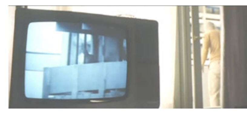
FIG. 10: STEVEN SPIELBERG. MUNICH. 2005.

CD: The main idea—and probably the most important one-was to imagine, that both terrorists and hostages could attend the live-broadcasting of their own drama. The concept of my installation is inspired by the imagination to enter the room just like in that moment, when Ankie Spitzer-the wife of one of the murdered Israeli-came in, right after the drama happened. The corpse is missing, only the destruction is visible. And just like a media 'afterglow' the TV is still showing the same news that also her husband, respectively hostages and terrorists have been all watching, and which, of course, influenced all the subsequent events. It was the news that informed the terrorists about how the German police tried to take over the situation by assault—going over the rooftops during "Operation Sunshine." That is why the assault was soon cancelled. For me, this live-feedback was extremely important to conceptualize my artwork.