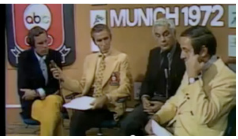
FIG. 4: CHRISTOPH DRAEGER, BLACK SEPTEMBER. 2002.

of the catastrophe he is reporting about. The video provokes various questions: How can the viewer distinguish between fictional reality and documentation? When even the 'expert' reporter is lost in terrible chaos, how is the viewer supposed to cope with bad news? Can evil transcend the safety-screen of our televisions? Where are the limits of the "disaster zone"? (Binswanger 1999: 54–61)