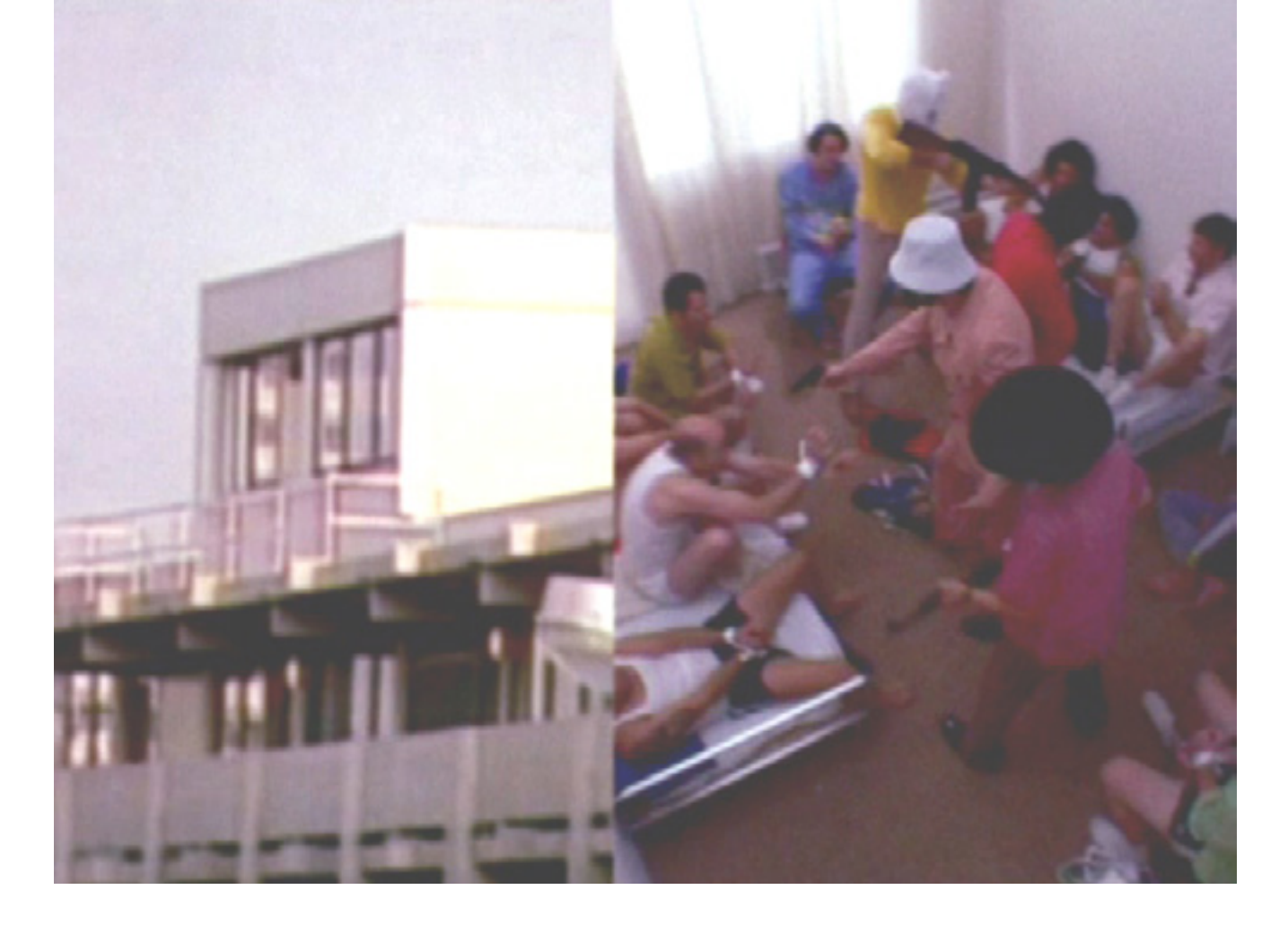
FIG. 8 AND 9: CHRISTOPH DRAEGER. BLACK SEPTEMBER. 2002.