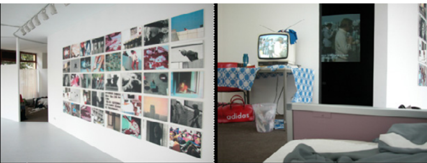
FIG. 1: CHRISTOPH DRAEGER, BLACK SEPTEMBER. 2002.