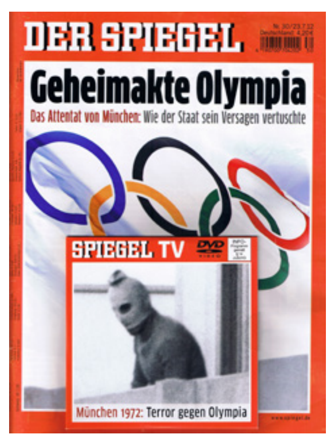
FIG. 7: COVER PAGE. DER SPIEGEL. GEHEIMAKTE OLYMPIA.

should do something in response to 9/11, but certainly nothing that is directly linked. There had been such an overload of reports and images in the media in the aftermath of September 11, 2001, I would have felt absurd to join in. Then I found this documentary movie and instantly knew: that is it, because it deals with a moment in history that in the meantime was almost forgotten. Even in Germany it had been blocked out in a way, probably because the assault had a bad impact on the image of Germany after the Olympic Games.