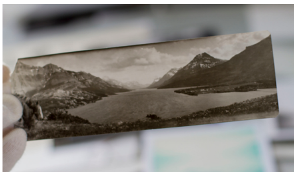
Fig. 1. Panoram by Frederick Herbert (Bert) Riggall, in collection/courtesy Trudi Lynn Smith