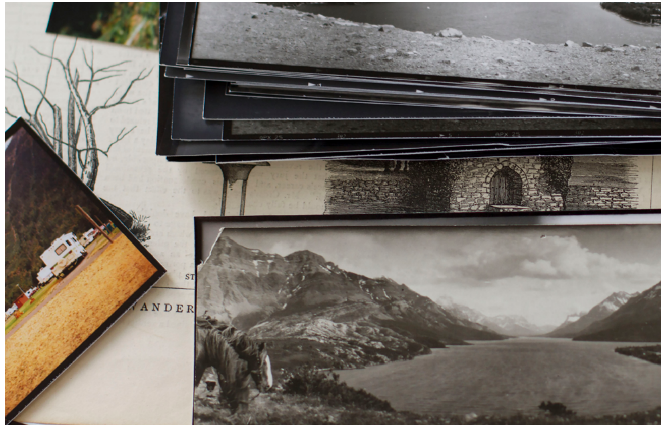
Fig. 7. Trudi Lynn Smith, interior

She follows him—obsessively, compulsively. She uses parallax to stand in his shadow and see through his eyes, but what she learns from parallax is impossibility. 14 The reasons for this are both concrete and abstract. First, the concrete: the town has grown in size; the snow in Riggall's picture has melted away; erosion has altered the shape of the hill; and trees have come and gone. 15 As markers of climate change and human