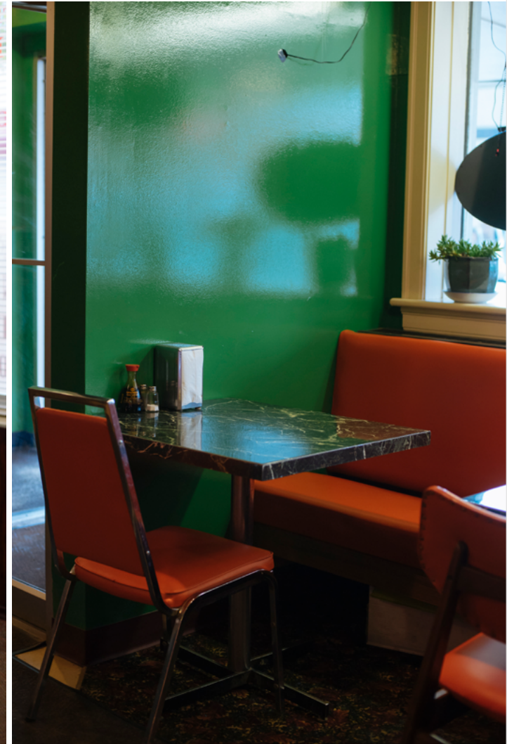
from left: Ng's Cafe ; The Dianna