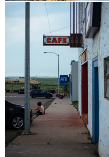
top to bottom: Stavely; Bonneyville; Turner Valley; Wainwright; Trochu