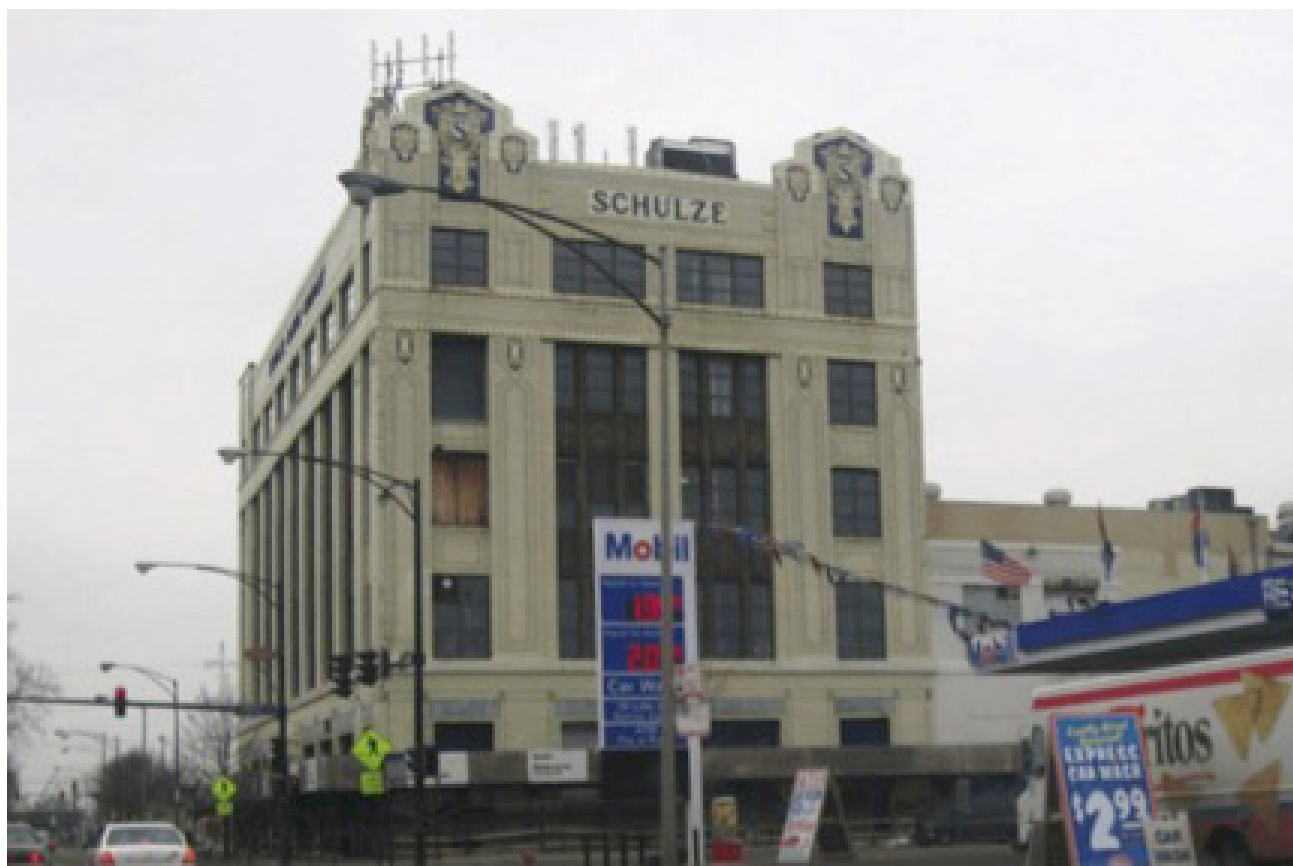
The Schulze Baking Company operated on Chicago's South Side from 1914–2004. The historic building is being turned into a data centre.

see that understanding where the infrastructure of computing is and why requires grappling with previous rounds of uneven capitalist development spanning back a century or