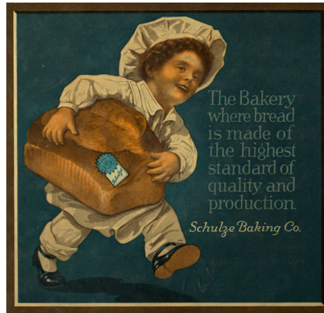
Schulze Baking Company advertisement.

ter. Like the project in the South Loop, the Schulze bakery contains features useful to the data industry. The building also has heavy-load-bearing floors as well as louvered windows designed to dissipate the heat from bread ovens (or in this case, servers). The neighborhood as a whole also makes the Schulze desirable. I interviewed a developer working on the Schulze redevelopment project and he told me that because the surrounding area had been deindustrialized, and because a large public housing project, the Robert Taylor Homes, had closed down in recent decades, the nearby power substations actually had plenty of idle capacity to meet the data centre's needs.