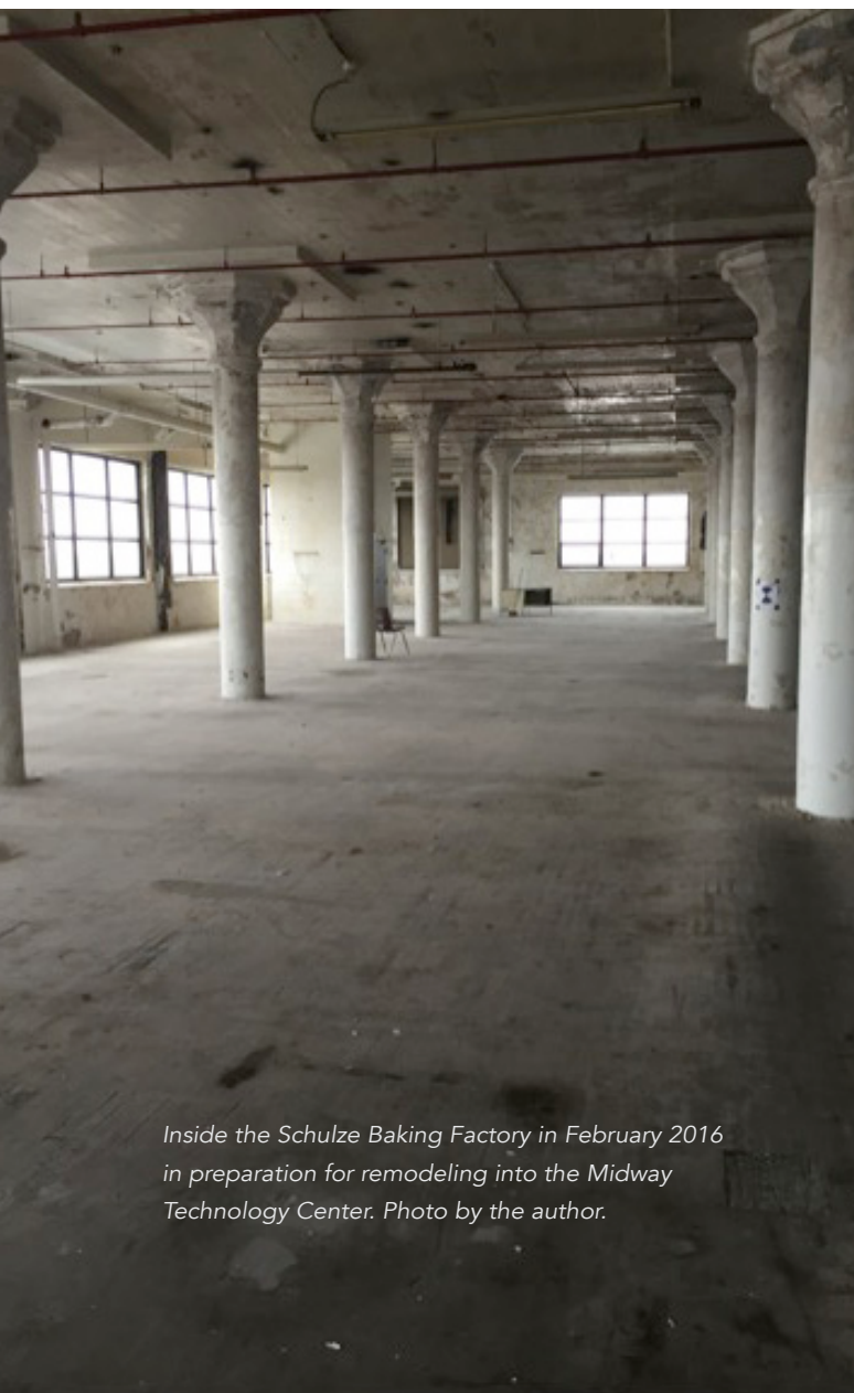
Inside the Schulze Baking Factory in February 2016 in preparation for remodeling into the Midway Technology Center.

have theorized capitalist development as inherently uneven across time and space; thus, boom and bust and growth and decline are two sides of the same coin. The implication here is that the landscapes we construct to serve the needs of today are always temporary. The smells of butternut bread defined part of everyday life in Washington Park for nearly a century. Today data is in the ascendancy, constructing landscapes suitable to its needs. Yet those landscapes will also be impermanent. What remains common over time, however, is that people struggle over the trajectories of that uneven development.