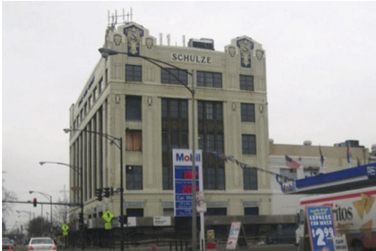
The Schulze Baking Company operated on Chicago's South Side from 1914–2004. The historic building is being turned into a data centre.

see that understanding where the infrastructure of computing is and why requires grappling with previous rounds of uneven capitalist development spanning back a century or