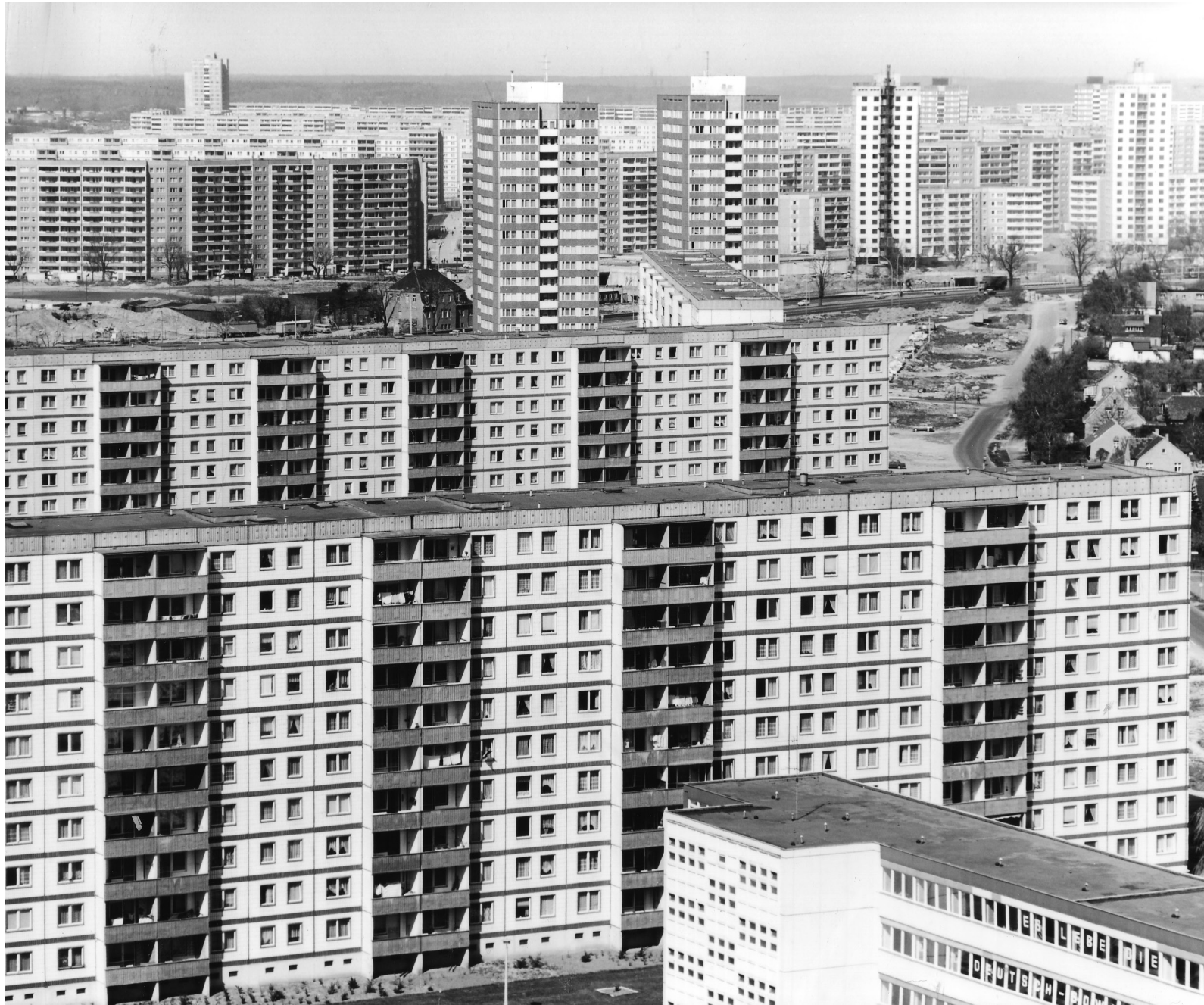
Figure 6: WBS 70 buildings in Marzahn, 1984.