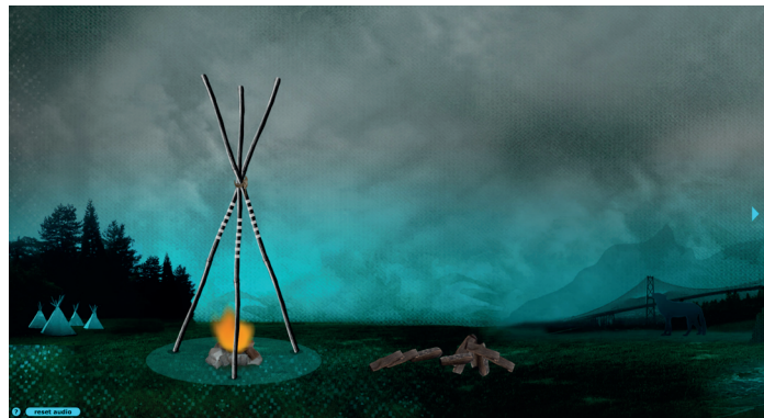
Figure 4. Cheryl L'Hirondelle, nikamon ohci askiy: songs because of the land , grunt gallery, http://www.bruntmag.com/issue5/cheryl-lhirondelle.html .

interact or engage within community or communal situations. For L'Hirondelle, "[t]he very act of erecting a tipi is a ceremony" (157). These sacred technologies animate in virtual spaces that are composed of the Indigenous material infrastructure of lands and routes.