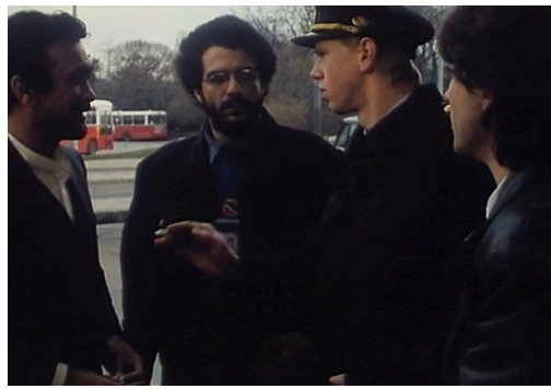
Figure 15 arriving at the Südbahnhof in I Love Vienna