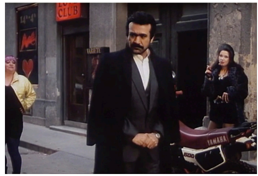
Figure 18 leaving the hotel in the 2nd district in I Love Vienna