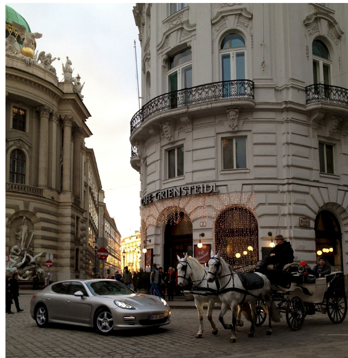
Figure 2 Café Griensteidl on the Michaelerplatz in Vienna