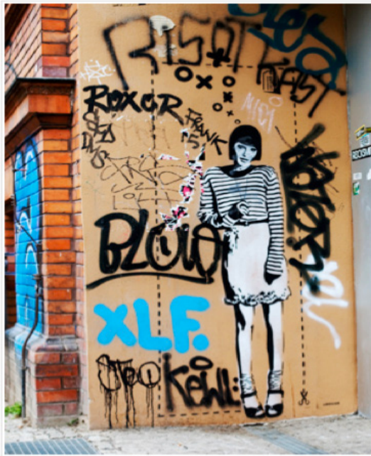
Figure 1 On the Street... Mitte, Berlin