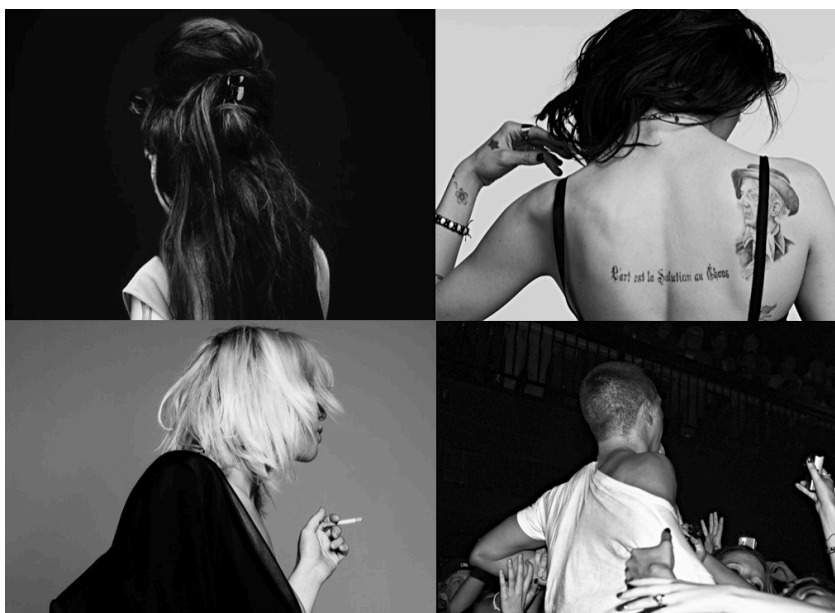
Figure 13 random collage of Slimane photos (S. Ingram)