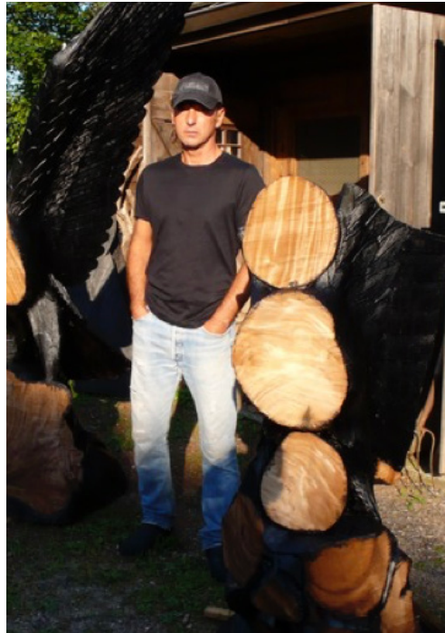
Figure 4 Helmut Lang, 2008

Conspicuous consumption is refused in favor of dress strategies that are disquieting and unknowable by those outside