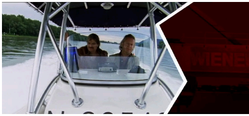
Figure 14 Soko Donau on water