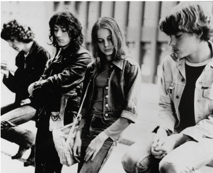
Figure 8 Christiane F. Wir Kinder vom Bahnhof Zoo (Images © 1981 Solaris Film, Maran Film, Popular Filmproduktion, CLV-Filmproduktions, Süddeutscher Rundfunk)

Berlin in the 1930s, just as Slimane was by what had taken Bowie there in the 1970s. However, while Bowie was attracted to the dark historical elements of Berlin that Menkes describes, which he found in Isherwood's work as well as in German expressionist art, 13 Slimane seems to have