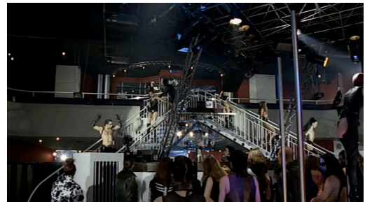
Figure 19 concert in the Arena