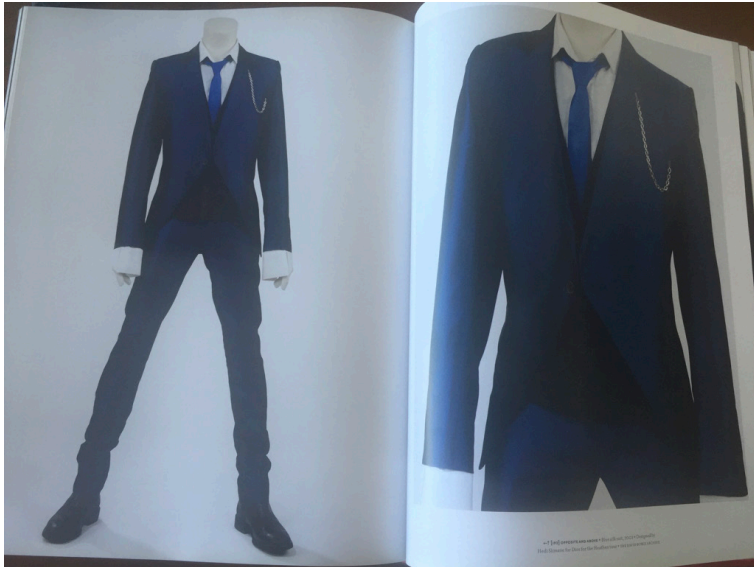
Figure 6 Slimane-designed suit for Bowie

Karl Lagerfeld famously lost 90 pounds in order to be able to wear (Figure 6). When Slimane won the Council of Fashion Designers of America award for international designer in 2002 (the award Helmut Lang won in 1996), Bowie was there to present him with it.