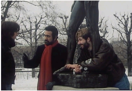
Figure 20 irreverent treatment of statue in I Love Vienna

one traditionally associates with the city: the Fiaker or horse-drawn carriage (Figure 17); the Iranian migrants find themselves housed in one of the city's seedier districts with prostitutes for neighbours—the 2. Leopoldstadt, which has in the meantime undergone substantial gentrification (Figure 18, cf. Suitner); and the Blutausch musician, who is played by Ostbahn Kurti, one of Vienna's most colourful countercultural characters, ends up in bondage after being abducted at a punk concert at the Arena (Figure 19). Even when tourist sites do appear in these productions, they are rubbed against the grain to show how little the imperial histories they stand for matter in the lives of contemporary residents from and on the peripheries (Figure 20).