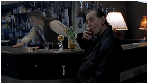
Figure 16 the Beisl in Blutrausch