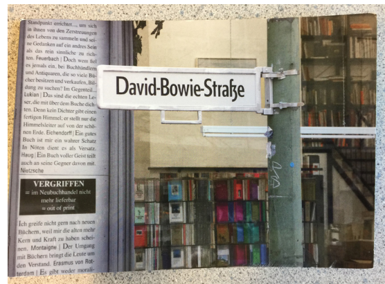
Figure 22 a postcard showing a street sign at Hauptstrasse 154/155, taken in January 2016 by Ute Volz

Blaagaard, Bolette, and Iris van der Tuin, eds. The Subject of Rosi Braidotti: Politics and Concepts . Bloomsbury Academic, 2014.