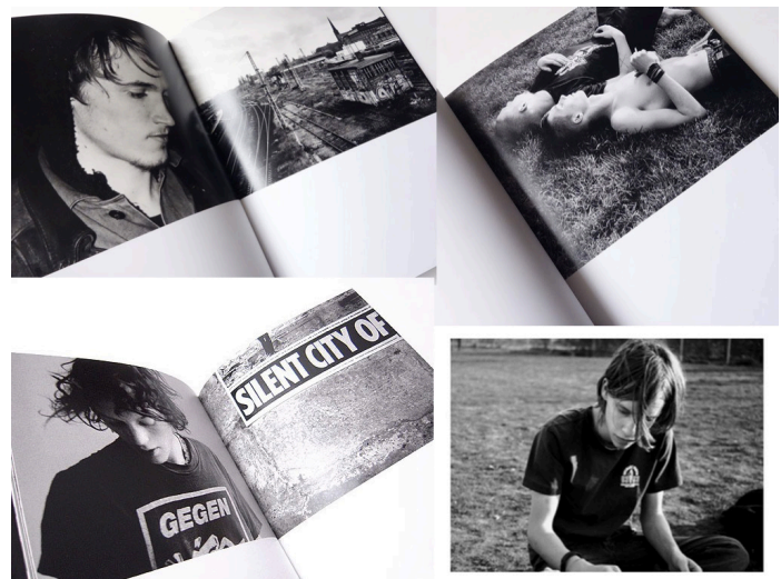
Figure 9 collage from Slimane's Berlin collection (S. Ingram)

While Slimane does not seem to have written any poems about the film or commented on it in