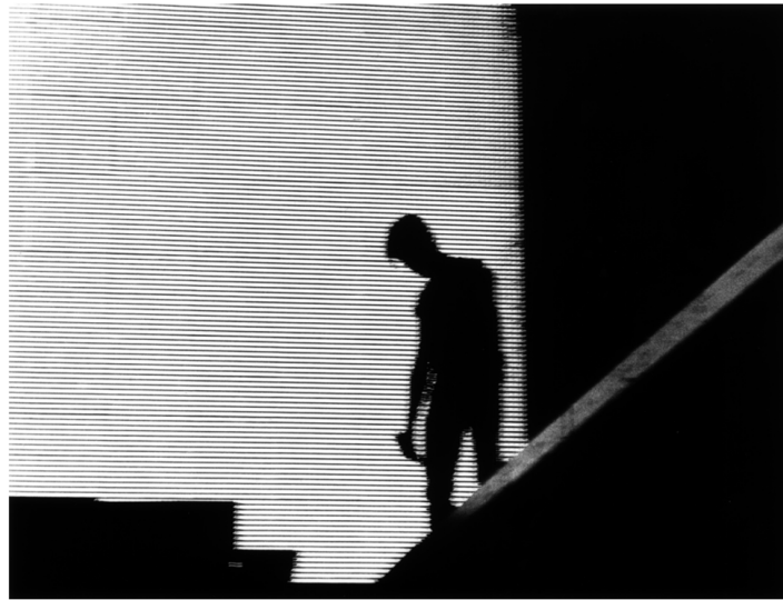
Figure 7 One of the images from Stages that Hedi Slimane republished on the occasion of Bowie’s death. (“Hedi Slimane’s Tribute to David Bowie”)