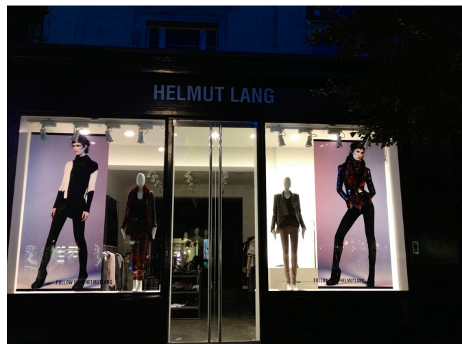
Figure 5 Helmut Lang boutique in Westbourne Grove, London

Post-Punk to Neo-Modern” 14). However, Lang quickly grew disenchanted by the growing consolidation of the fashion industry into conglomerates. When the Prada Group sought to consolidate its position as a leading luxury conglomerate at the end of the 1990s by acquiring labels and came knocking at Helmut Lang, he first ceded 51% of his company in 1999 and the remainder in 2004. He left the company the following year, retired from fashion, and has since been devoting himself to his work as an artist. As we argue in Wiener Chic , Lang’s refusal to kowtow to global fashion’s powers-that-be, maintaining instead a relationship to the fashion world resolutely on his own terms, 5 is indicative of, and in keeping with, the larger Viennese fashion system, just as the rest of the city’s non-high culture, tourist-oriented cultural production exists