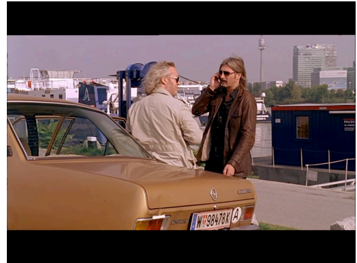
Figure 17 Soko Donau on land