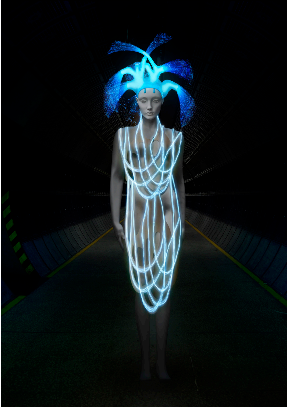
Electric Dreams Day dreams, eeg sensors, fiberoptiks, felt 2009