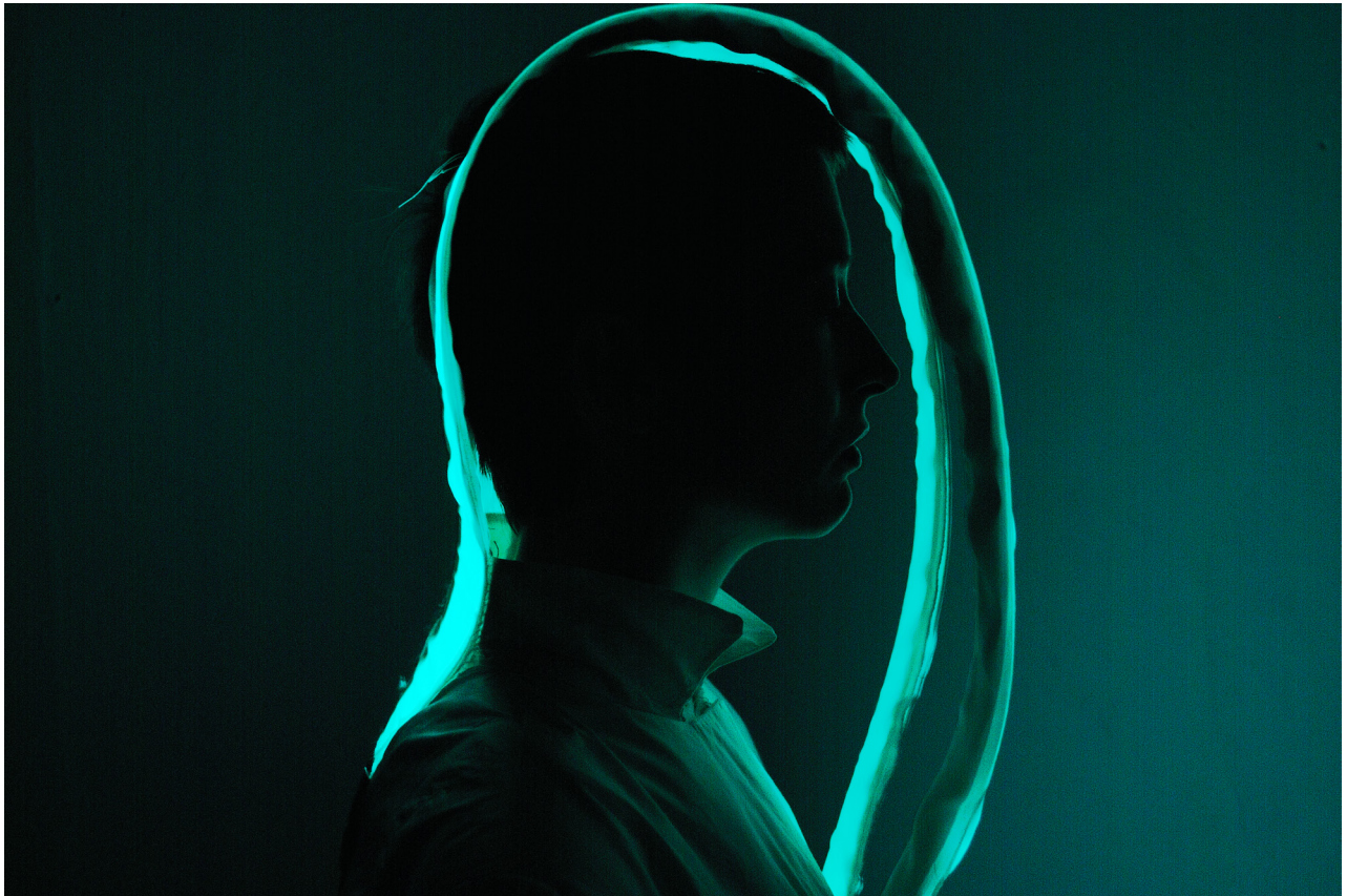
Electric Skin, breath, silk, silkscreened electroluminescent panels, electricity, Vancouver Olympics 2010