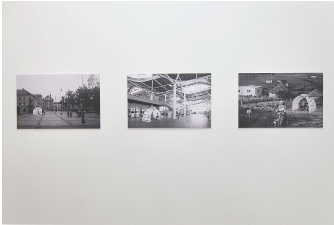
Annemarie Hou and Patrick Mahon, with Tegan Moore, Display photographs of proposed D4DS usages, Design for a Dissemination Station , Galleri KiT, Trondheim, 2017. Portable tent structures with sound installation.