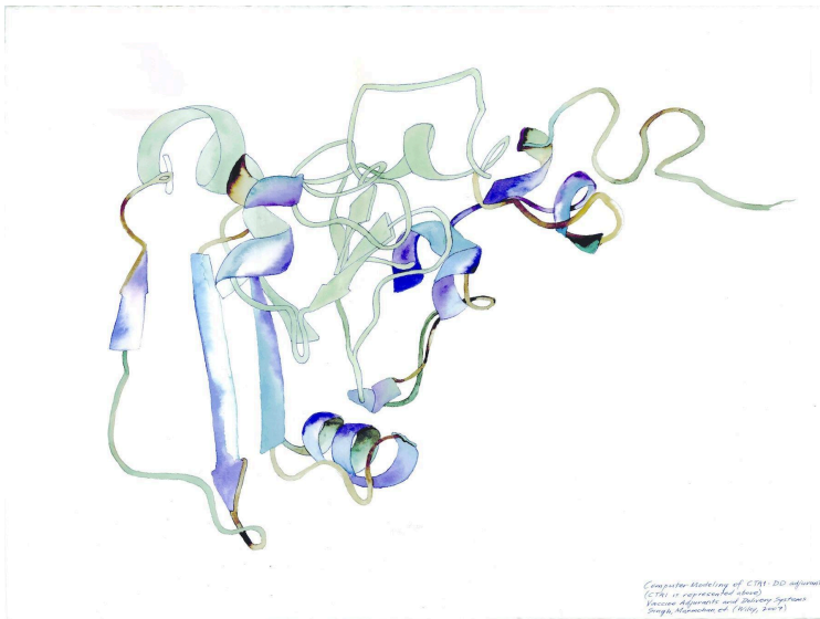
Figure 3: Patrick Mahon, watercolour detail of Vaccine Adjuvant for Design for a Dissemunization Station, UNAIDS, Geneva, 2017. Image courtesy of the artist.

Hou and Mahon’s working methods initially involved online exchanges of text (conversations, readings, data), images (drawings, rough designs, found images), and other materials that they thought might help inspire collaboration. Among the various materials exchanged, some of the most compelling included historical radio broadcasts reporting on important vaccine discoveries, news bulletins about outbreaks and epidemics, images of adjuvants and viruses, and visualizations of how vaccines work in the body. As collaborators, they were conscious of the question of how to capture vaccines and vaccination in an artistic manner. The visual materials they exchanged therefore included the microscopic and digitally produced, as well as the pictorial, such as photography of vaccine administration and representations of the “cold chain.” 1