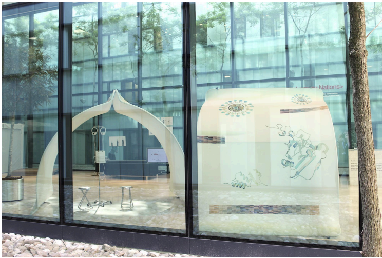
Figure 7: Installation view (from exterior courtyard), Design for a Dissemination Station , UNAIDS, Geneva, 2017. Portable tent structures with sound installation.