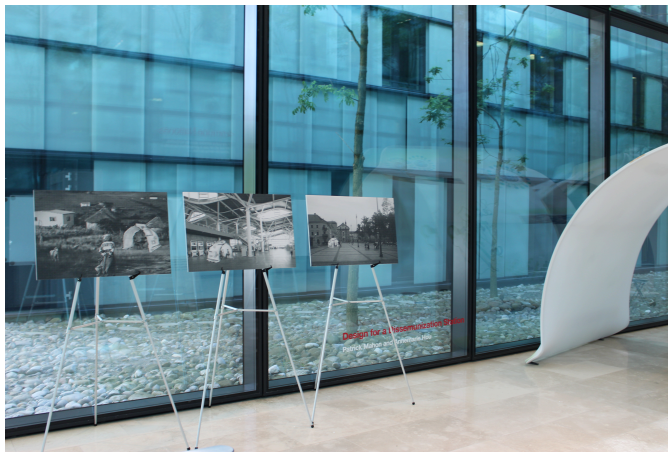
Figure 4: Display photographs of proposed D4DS usages, Design for a Dissemination Station , UNAIDS, Geneva, 2017. Portable tent structures with sound installation.

access (to good information, and, for many in the world, to vaccines themselves), and debating ideas regarding representation. In the latter regard, the pair asked broadly, “What do vaccines ‘look like’? How do we understand vaccines through various forms of visual representation, through the image culture that we are exposed to?” This led to research into biomimicry—the design of materials and structures modelled on biological entities and processes. At this point, they also began to discuss the degree to which, given the global context they hoped to deal with, their work should be committed to ideas of mobility—not only the mobility required to distribute information and vaccines themselves, but the realization that if art is going to offer meaningful impact in the context of vaccine discussions and realities, then the artwork itself would need to invoke forms of mobility through its propositional character and its structure.