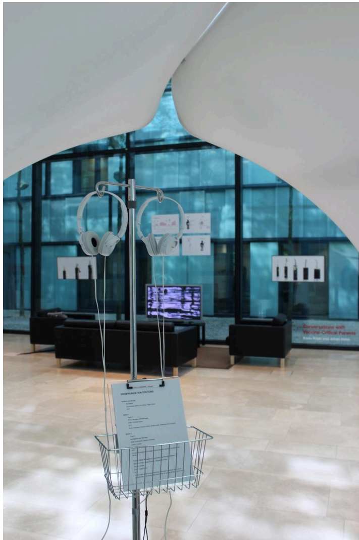
Figure 6: Installation of sound components by Tegan Moore, Design for a Dissemination Station, UNAIDS, Geneva, 2017. Portable tent structures with sound installation.