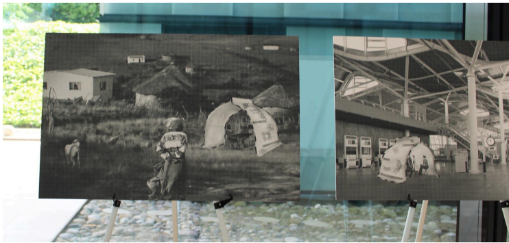
Figure 5: Display photographs of proposed D4DS usages (detail), Design for a Dissemination Station, UNAIDS, Geneva, 2017. Portable tent structures with sound installation.