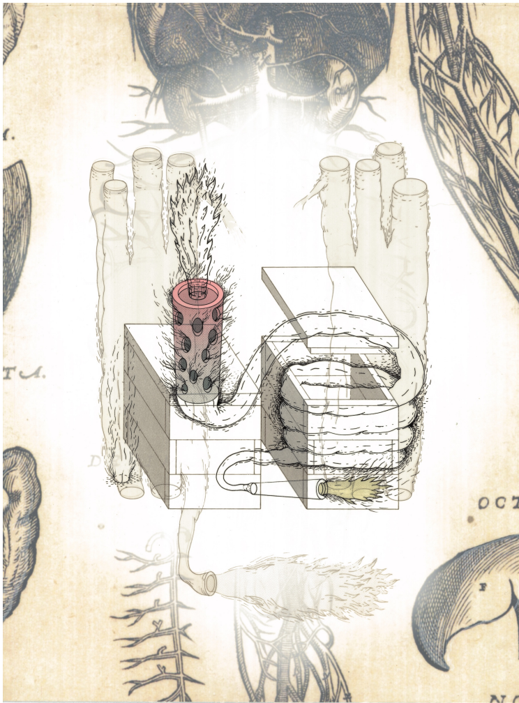
Sean Caulfield, Virus #1 (Study for The Anatomy Table ), 2016. Silkscreen and digital printing on drafting film and rag paper. 61 x 45.72 cm.