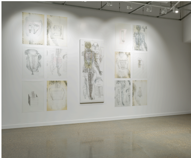
Sean Caulfield, The Anatomy Table , Galleri KiT, Trondheim, 2017. Silkscreen and digital printing on drafting film, plexi and Photo Tex.