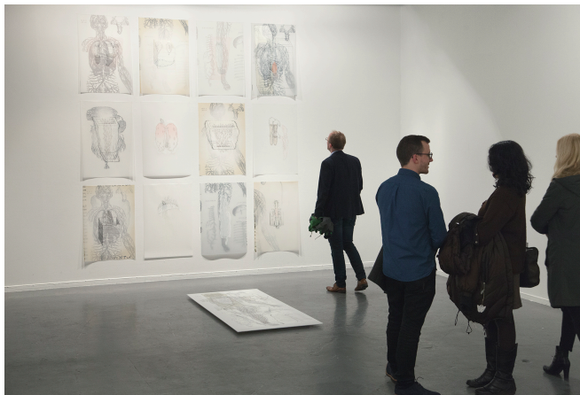
Sean Caulfield, The Anatomy Table , Galleri KiT, Trondheim, 2017. Silkscreen and digital printing on drafting film, plexi and Photo Tex.