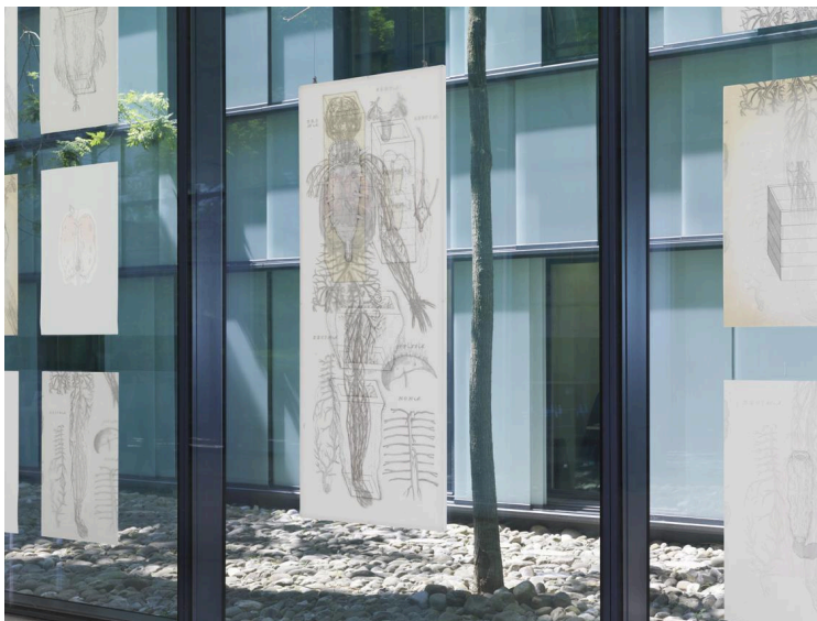
Figure 1: Installation view of The Anatomy Table, UNAIDS, Geneva, Switzerland, 2017.