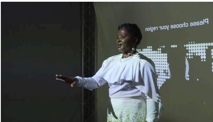
Figure 4: First Lady of Namibia Monica Geingos plays Shadowpox at the <Immune Nations> opening, UNAIDS, 2017.