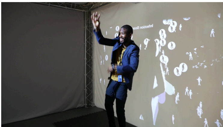
Figure 1: Shadowpox player at the <Immune Nations> exhibition opening, UNAIDS, 2017.