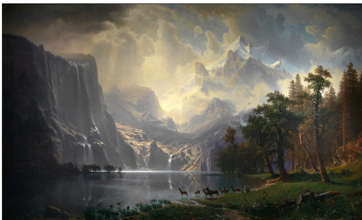
Fig. 1: Bierstadt, Albert. Among the Sierra Nevada, California . 1868.

M onkman’s landscape-painting oeuvre is extensive, with the majority of his early work stemming from his visual retellings of the story of the 19 th -century American West. While for his exhibition at the Metropolitan Museum of Art he did not repaint American West landscape paintings, Monkman did reinterpret Emanuel Leutze’s Washington Crossing the Delaware (1851), a seminal portraiture of US American history. Masterfully, if ironically, his landscapes offer narratives that with the help of Miss Chief, her followers, and lovers refigure the buffalo, deer, and the “Dead Indian” in the works of the 19 th -century Euro-American writers and artists, who, as we saw above, attempted to preserve and remember Indigenous peoples of North America.