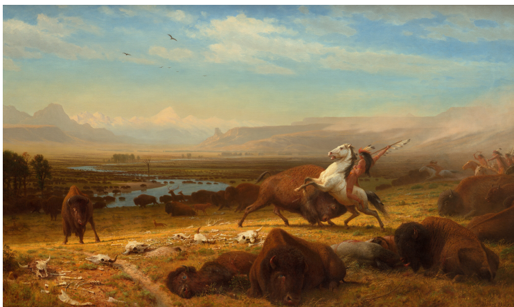
Fig.2: Bierstadt, Albert. The Last of the Buffalo . 1888.

The second Bierstadt painting of interest here that Monkman has reworked is the 1888 oil on canvas Last of the Buffalo , a painting that I saw when at the Buffalo Bill Center of the West in Cody, Wyoming. Immediately, I was struck by the power of the scene: the decimation and carnage of the buffalo carcasses with the arresting landscape in the background, together with the lone warrior, his spear raised as his horse is gored by one of the remaining buffalo. It represented to me the romanticisation of the American West, the understanding that the frontier was now closed, with the buffalo and warrior remnants of an era now firmly situated in the past. Called Bierstadt’s “final, great, western painting” (National Gallery of Art), it is also one of Bierstadt’s most famous, as well as an iconic example of 19 th -century art of the American West. The title of the painting is a clear reference to the expected extinction of the plains buffalo, together with the Indigenous peoples and their traditional way of life. Buffalo were essential to the survival of many Indigenous tribes, and the settler expansion of the West coupled with excessive overhunting and the intentional destruction of the buffalo as a policy to destroy them as a source of food and clothing for Indigenous populations led to the rapid decrease in buffalo numbers and left Plains Indian tribes