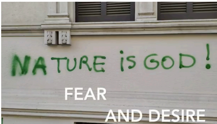
Figure 8: Still from “Birdsong” (Snepvangers, Murray, Pronzato, and Waysdorf, 2020, 2:30 mins)

The video is a visual essay that incorporates many still images, including drawings and photographs, with a series of fragments of dense quotations and excerpted comments in text in English from May and June 2020 threaded among the stills. The text (more than the images) raise questions about the relationship of human to more-than-human, about the (macro) threats posed by the virus, by protests, by contested politics, and the (micro) comforts from a privileged position of researcher.