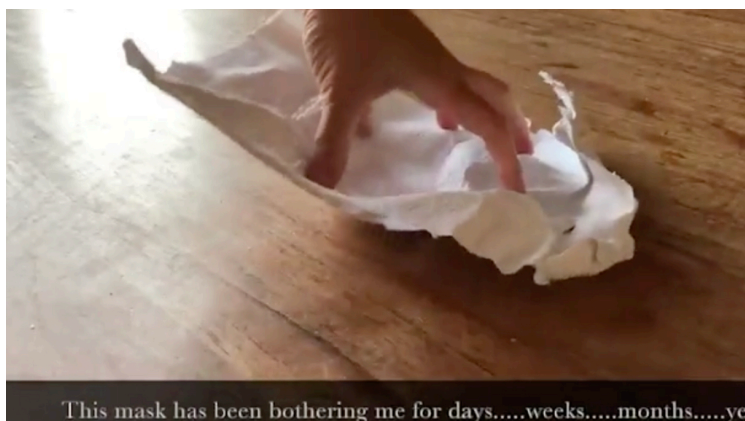
Figure 2: Still from “Braiding Dislocated Lives” (Frølund et al; 2020, 2:25 mins).