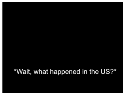
Figures 6 and 7: Stills from “Braided work visual art (Brode-Roger, Erdely, and Murray, 2020, 2:00 mins, no sound).