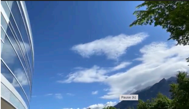
Figure 5: Still from “The Warrior” (Torres, Peterken, Jones, and Chen, 2020, 0:51 mins).

consumerism, time to write, etc.), or recovery strategies to be developed to ameliorate damage that was done during this time, or to what degree participation in social justice protests and efforts to change nation-state regulations, legislation, and budget processes could affect policing practices, policy development, and funding.