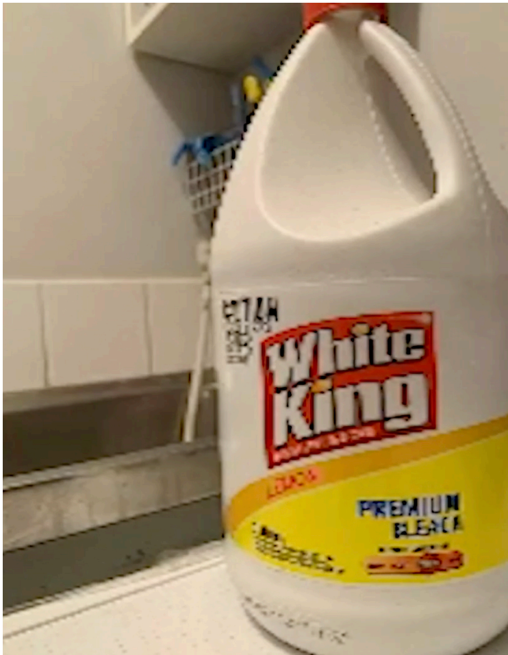
Figure 4: Still from “Out, Empty, Away” (Seddighi, Murray, Dorsey, and Sarwatay, 2020, 3:29 mins).

liciously lush green forest, accompanied by a quiet piano sonata, “On a Summer’s Day”.