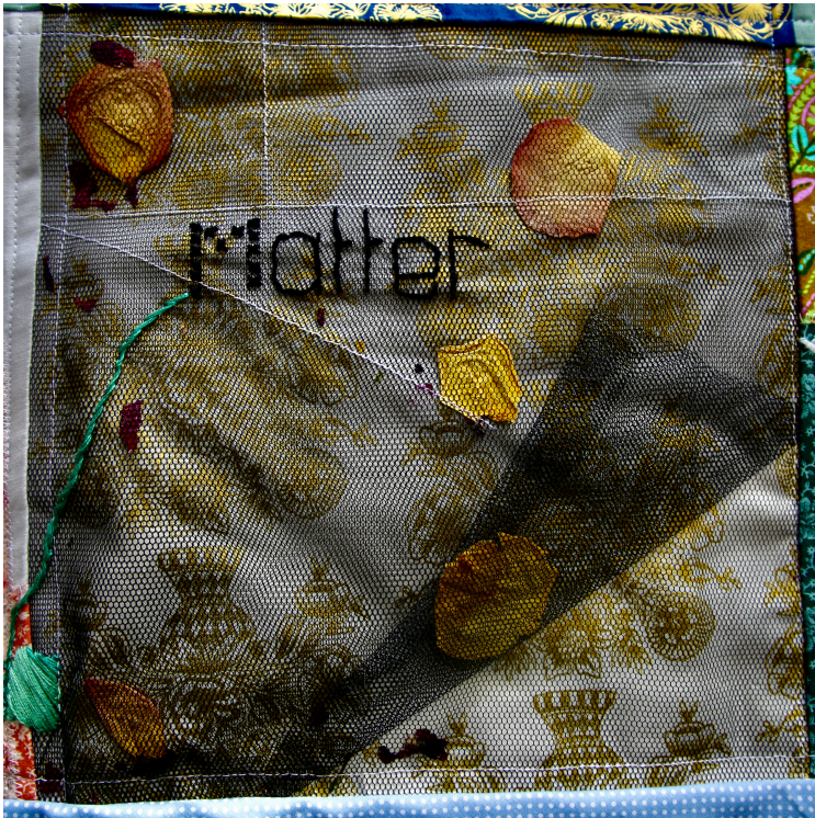
Figure 1: Matter. Corinna Peterken.