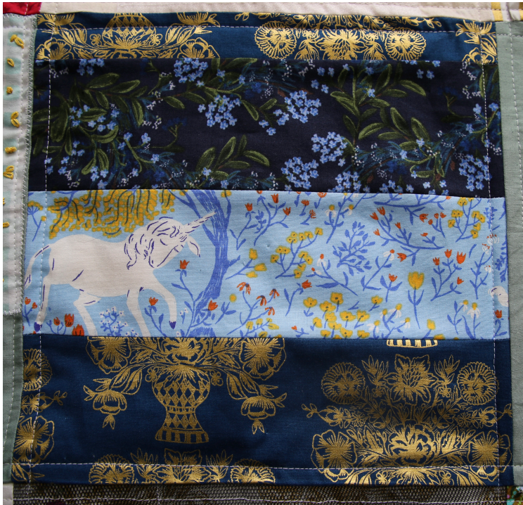
Figure 1: Blue. Corinna Peterken.