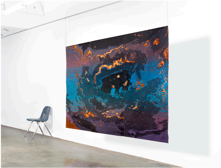
Figure 1: Ruth Beer, Oil Topography (2014). Hand-woven jacquard tapestry: copper wire, polyester, cotton, 218 x 305 x 1.5 cm.

the content of representation and toward the materials, material conditions, and material infrastructures that make such representation possible, doing so would open up a world composed of “vibrant matter” and “evocative objects” (Bennett, Turkle).