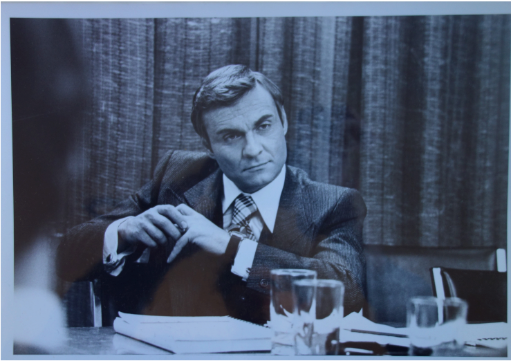
Figure 5: Kenneth Welsh as Peter Lougheed in The Tar Sands , 1977.

would react to the show, he replied “I suspect both of them are going to go through the roof” (Waters 1977, A23). Perhaps unsurprisingly, with his political leanings, Hurtig stood behind the show, commenting “It is a very accurate reflection of the process of bargaining that occurred over the Syncrude plant” (Calgary Herald 1977, A1) and went as far to say that the CBC had “performed a remarkable public service and has, in fact, been very courageous. It (the show) was unique, one of a kind. They’ll never put on anything as tough” (Toronto Star 1977, A69).