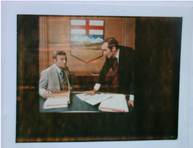
Figure 3: Peter Lougheed (Kenneth Welsh) and Willard Alexander (Ken Pogue) in The Tar Sands, 1977.