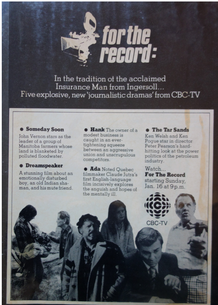
Figure 2: For the Record Advertisement, 1977

myths, Roland Barthes reminds us, make history seem natural, yet their creation “is constituted by the loss of the historical quality of things: in it, things lose the memory that they once were made of”