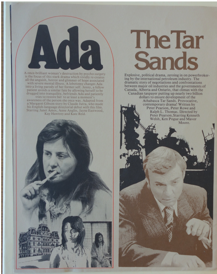
Figure 1: Page from For the Record promotional pamphlet produced by CBC, 1977.

his government backed themselves into. Excavating The Tar Sands affords a unique opportunity to further expose fossil fuel's long-standing dominant position in the Canadian political and social imagination. This article, as part of a larger research project, is an initial attempt to extract The Tar Sands and its surrounding controversy from the tarry memory hole into which it was cast. It argues that while