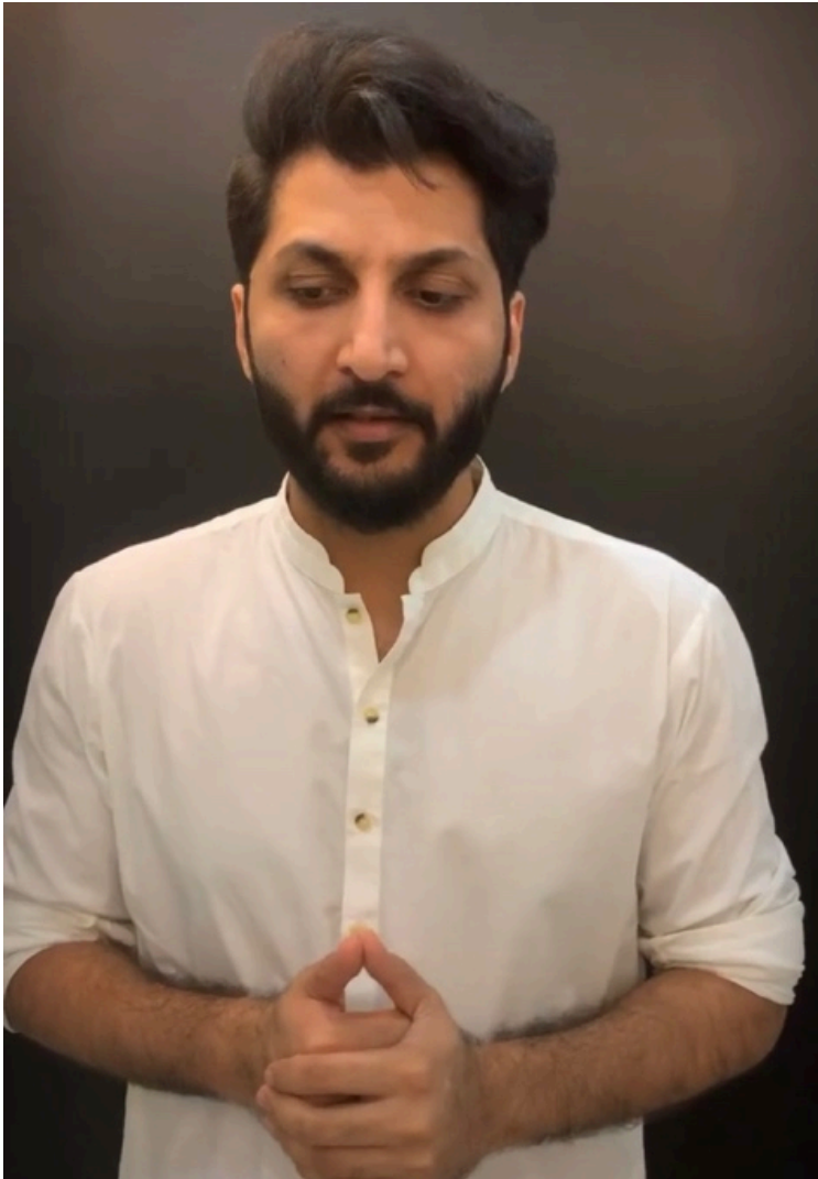
Figure 4: Image still from Instagram video posted by Bilal Saeed (@bilalsaeed_music).

team members. However, he emphasizes that just like everyone else, they, too, are human, and to err is human. Saeed further reassures his