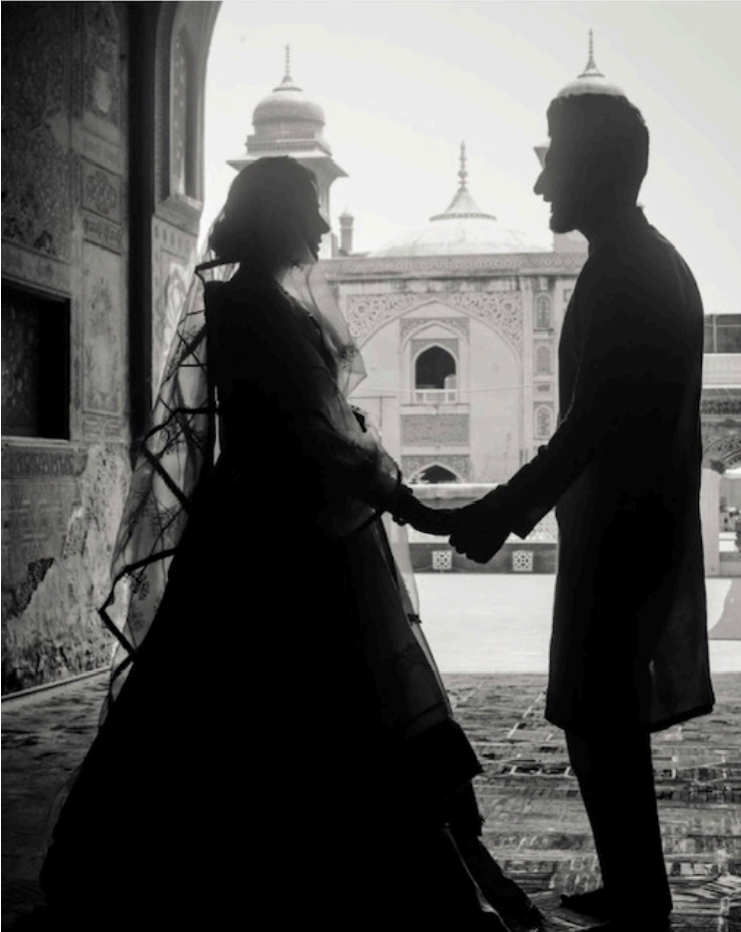
Figure 1: Instagram image posted by Bilal Saeed (@bilalsaeed_music).

was now readily abusing the duo and shunning them for disrespecting Islam through the defilement of a mosque. Although the Instagram post generated 86 700 views and around 751 comments, most of them were charged with abusive and profane language (“One Two Records Presents”). One Instagram user openly questioned whether