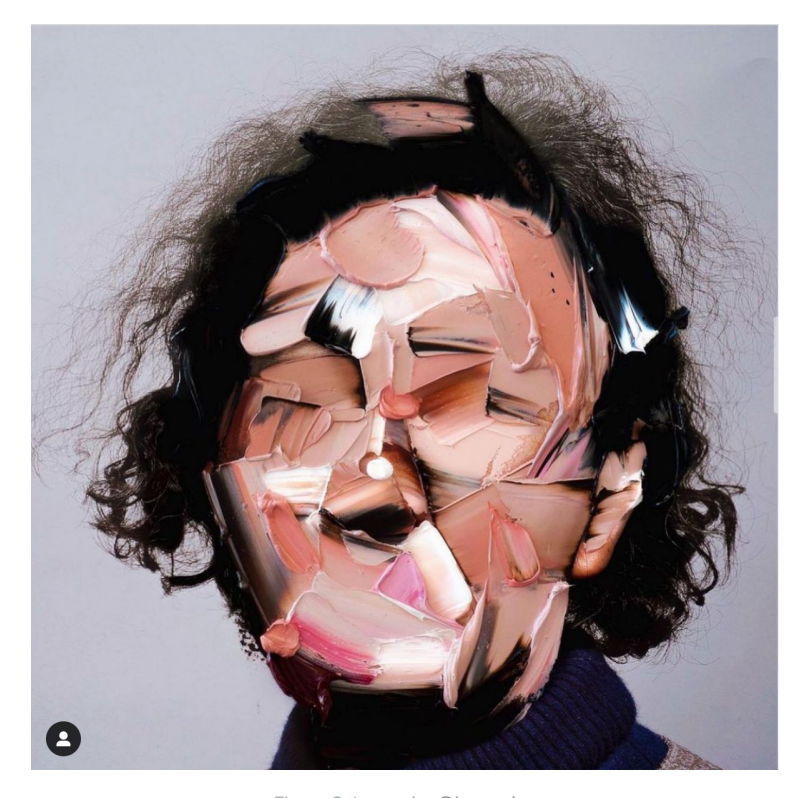
Figure 2: Image by @joeyunlee

her country. Similarly, the post below also stands for the collective Asian-American resistance against the dominant structures of whiteness.