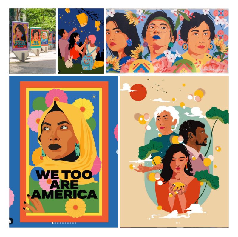
Figure 5: Instagram Images: Courtesy of Amanda Phingbodhipakkiya (@alonglastname)

The above image showcases various installations across the city as well as a magazine cover that prominently features Asian-Americans as well as Pacific Highlanders through art. For one of the city's many installations, represented by the first image above, Amanda writes: