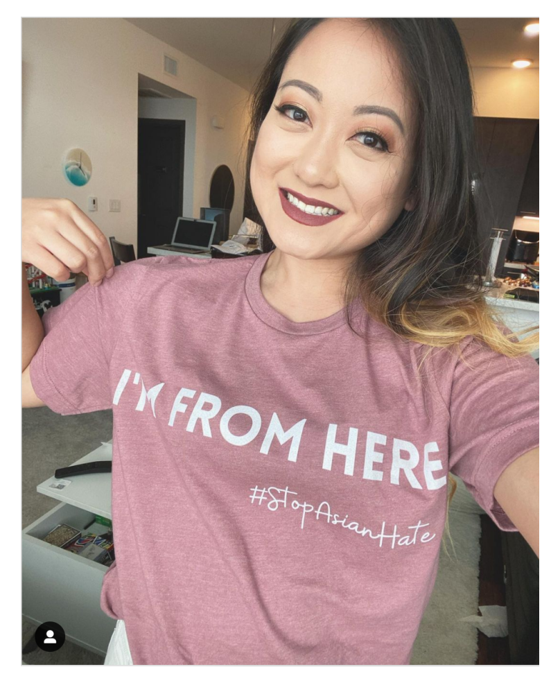
Figure 3: Image posted by @alicynreikoart

committed to it! I love how rich my background is and the food is GREAT!"