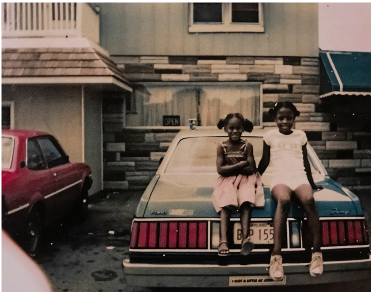
Figure 1: Mom and Teyonya, 1978

In “Poses with Cars,” for example, Cherlise vitates her discussion of the automobile as a symbol of upward social mobility with a series of disarming family photographs, including one of her mother and aunt perched on the trunk of a mid-1970s Ford sedan [figure 1]. By sharing this sort of intimacy with the reader/viewer, she is able to present her own views about photography in a personal and often disarming way, whether it is her unabashed embrace of the snapshot as an unusually authentic and democratic form of documentation, or her belief that images of African American leisure and play can take on radical meaning given photography’s historical focus on Black labour (Cherlise 2023: 7-10, 167).