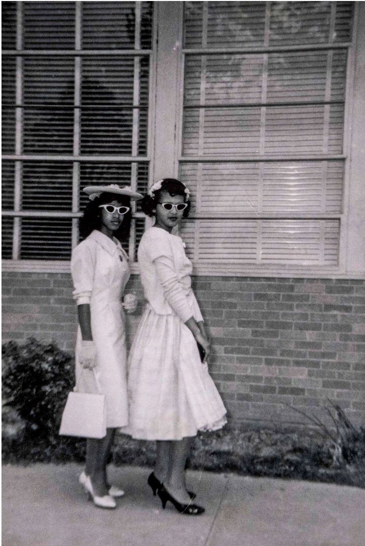
Figure 2: Ladies from Louisiana posing in front of E.J. Campbell High School, Nacogdoches County, TX, 1958