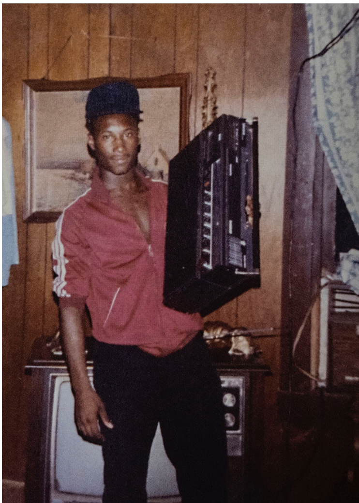
Figure 4: Milwaukee, WI, 1980s