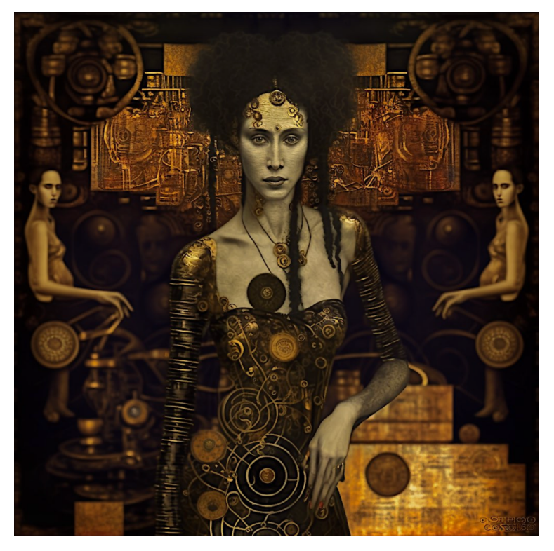
Figure 1: "Medea", image created by the author on Midjourney

house is burning in flames. A man approaches. A woman stands on the rooftop screaming: "Nothing is possible anymore!" A still image of the sun rising over the horizon appears on the screen. End credits roll in. Such is the closing scene of Pier Paolo Pasolini's 1969 film Medea , starring Maria Callas in what