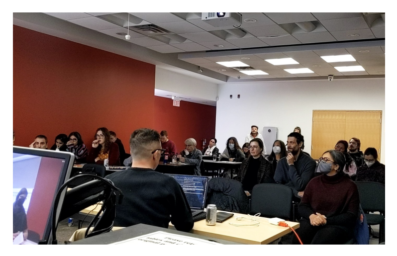
Figure 2: A Research-creation Episteme? Practice-based Research and Institutional Critique. Trent University, October 30, 2023.